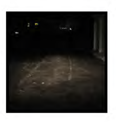
10. Here's how the stock headlight low beam lights up the road at night.

Cyron Inc. 21029-C Itasca Street Chatsworth, CA 91311 USA 818-772-1900 Cyron.com